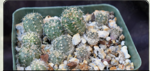
Gymnocalycium meregallii Seedlings from 2025