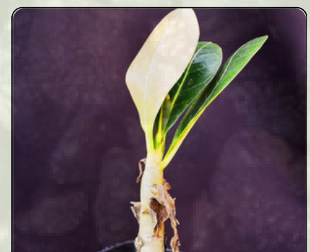
Adenium arabicum Seedling from Feb. 2024