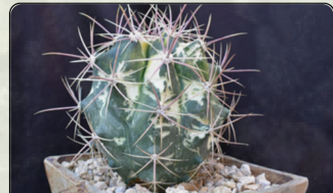
Ferocactus fordii Seedling from Feb. 2024