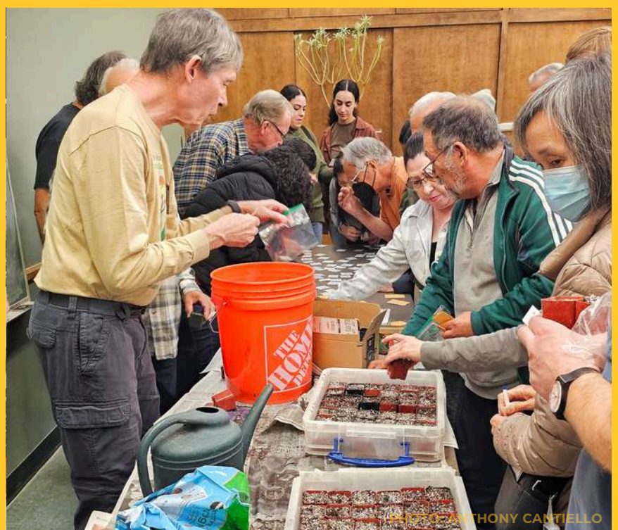
In November, we held another successful Winter Seed Workshop!