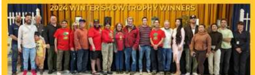
2024 WINTER SHOW TROPHY WINNERS