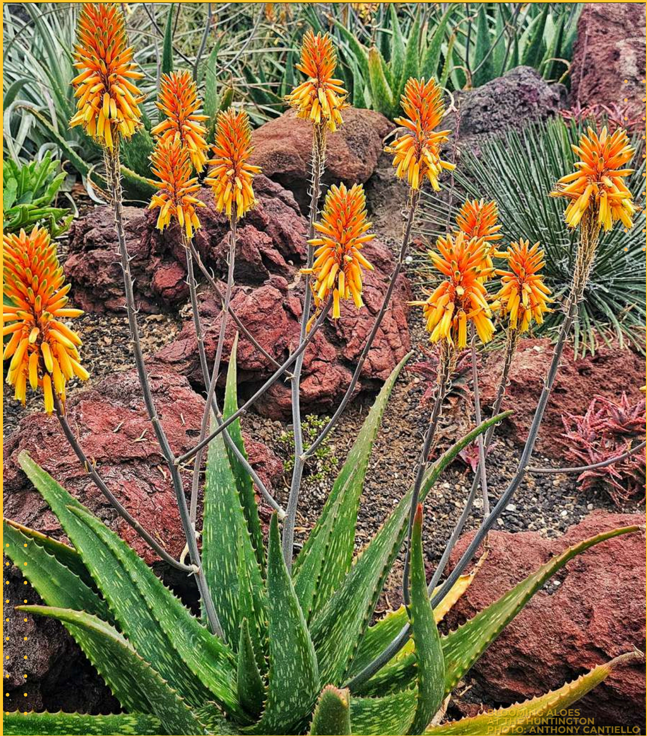
BLOOMING ALOES AT THE HUNTINGTON