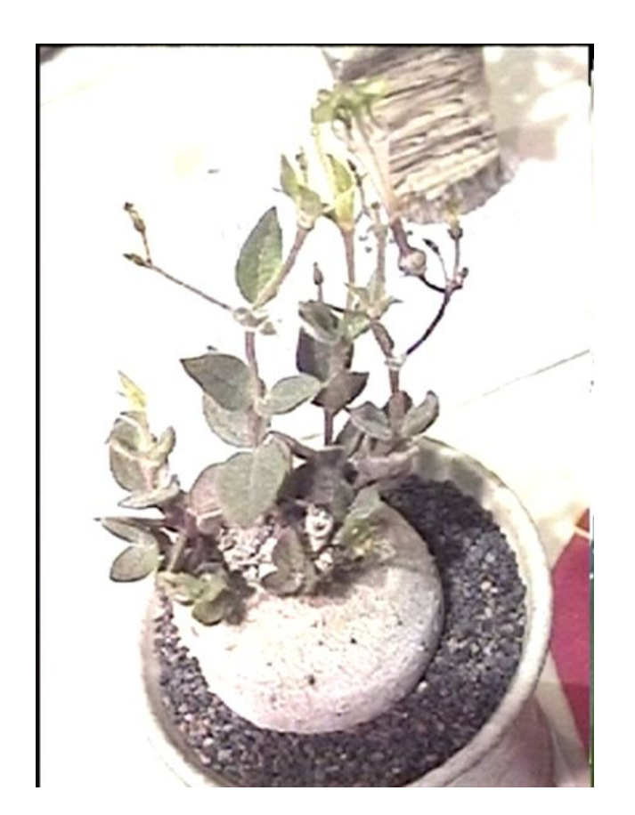
Figure Ceropegia renaldii

Matalaea is a new world genus of caudiciform asclepiads, that is only recently coming into cultivation. Two species currently available are Matalaea condesiflora a native of Venezuela, and Matalaea cyclophyllus a native of Mexico. These are grown similarly to Raphionacme. They form very large caudexes relatively quickly, and like Raphionacme and all of the more tropical asclepiads, are sensitive to simultaneous cold and wet.