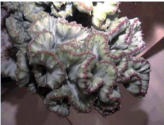
Euphorbia lactea Grey Ghost Crest entered in the 2001 Intercity Show by Lem and Pat Higgs

Cresting and monstrose growth are two of the three most common mutations, the other being variegation. Two or even all three forms are sometimes combined in a single plant. For this month, any combination of cresting or monstrosity either alone, or together or combined with variegated growth is acceptable. Grafted plants are also welcome.