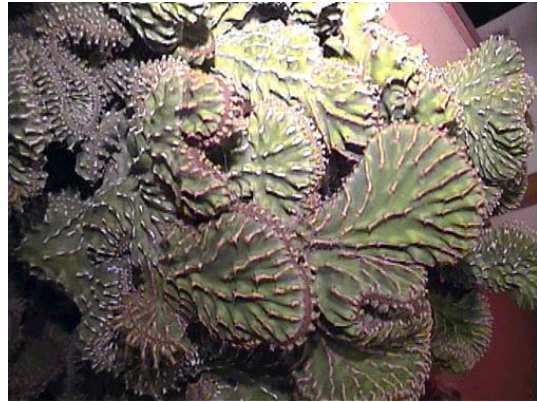
Euphorbia Zig Zag entered in the 2001 Intercity Show by Duke and Kaz Benadom

Cresting is not unique to succulent plants. Crests are found in many genera of non-succulent plants, including conifers and many common garden plants.