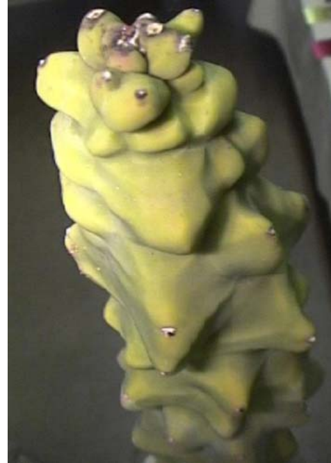
Lophocereus schottii monstrose

Crests and Monstrose plants flower and produce seed, just as other plants do, but less often. Good strong growth is probably the best way to produce a flowering crest. Crests and Monstrosity are not generally transmitted by seed; however, seed from a mutant plant is much more likely to be a genetic mutant than that from a normal plant. The genetic mutation is more likely to be the same as the parent, but any other mutation is also possible.