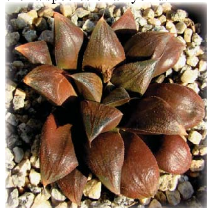
Haworthia cv. Chocolate