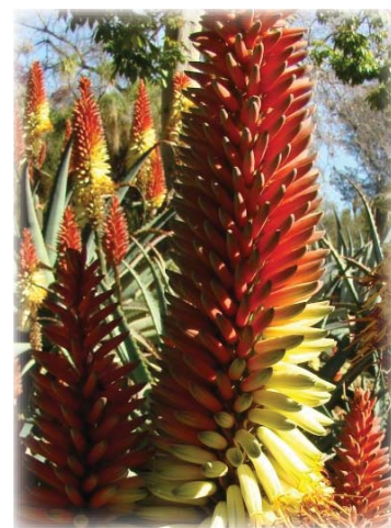
Aloe cv. David Verity

In some cases the cross between two parent plants produces a large number of seedlings that are interesting. These are all maintained, and are described as a grex. The cross that produced Haworthia 'Bev's Wonder' resulted in several seedlings, and this is more properly maintained as a grex. The cross has been repeated by several growers with plants that look similar, but not identical to the original release. In this case the proper nomenclature would be Haworthia × 'Bev's Wonder' grex, however this level of documentation is almost never seen outside the orchid world.