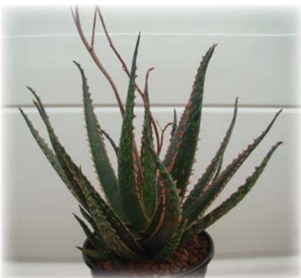
Aloe cv. Coral Fire

Hybrids are the offspring of two plants of different species. Examples of hybrids are the many Mada-