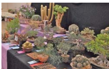
Outstanding plants on the trophy table.