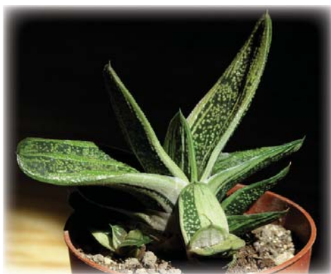
Gasteria "Little Warty"