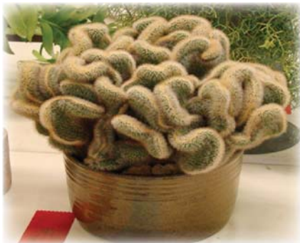
Haageocereus pseudodomelanostele cristata

Many plant lovers and scientists consider Crested, Monstrose and other genetic differences to be too far from normal and discard those from the seed batches. Cactus & Succulent people are not of that mind. The crazier the deviation from normal the better for us.