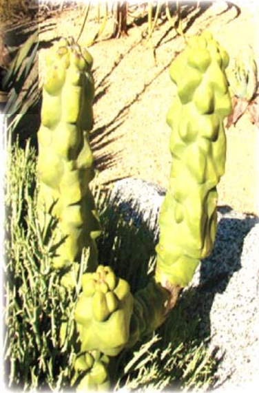
Pachycereus schottii monstrosus