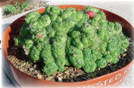
Mammillaria bocasana monstrosus "Fred"