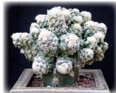
Ariocarpus retusus v furfuraceus monstrose

Care of grafted plants is not much different than that of other plants. It is good practice to keep the grafted area dry. Many of the scions are weak plants and attract mealybugs and other cultivation problems. It's a good idea to keep an eye out for problems. Rootstocks will often send out offshoots (i.e., "suckers") around the scion. These have to be removed. Leaving them on will deprive the scion of nutrients and the graft will fail. Although grafted cacti can last for many years, sooner or later it will be necessary to either regraft it or take cuttings and graft them onto new rootstock.