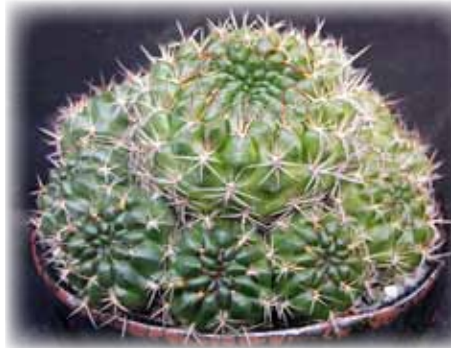
Rebutia mentosa purpurea

Rebutia mentosa purpurea is green when in