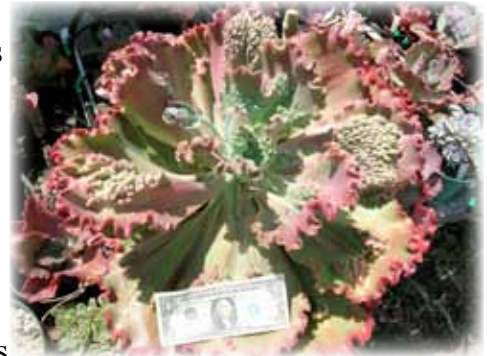
Echeveria 'Dick Wright'

There are hundreds of species and cultivars and probably an even larger number of hybrids. Some, such as Echeveria elgans , grows to about 3" and then begins to form clusters or mounds. Others, such as E. lilacina , grow to about 10" and generally remains solitary. If you want the really big ones you will have to seek out some of the many hybrids. Some such as E. 'Dick Wright' .