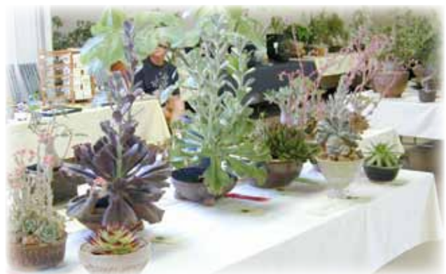
Plants in Show with large flower stalks

Mealybugs & aphids can be a problem as can snails & slugs. As with most plants, prevention is far more effective than treating plants that are being attacked. Aphids and minor mealybug infestations can be treated with a strong spray of water every couple days. It doesn't kill them, but is usually enough to disrupt their life cycle and drive them away to somewhere else. Use extreme caution when using pesticides, many members of the Crassulaceae family are easily damaged by the solution used to carry them. A better method of control is to use some form of systemic and keep the bugs away in the first place. All