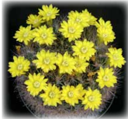
Tom Glavich, March 2014

Rebutia neocumingii (Weingartia longigibba) is variable, with many great forms. One is shown in the accompanying picture.