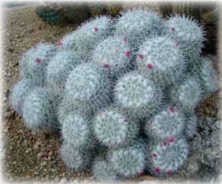
Mammillaria geminispina growing in the Hemenway garden.

Mammillaria nivos generally has a dark green body, offset with woolly areoles, and open yellow spines.