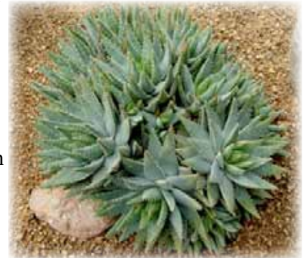
Aloe brevifolia from the Cape Region of South Africa.

We find Aloes particularly easy to grow in Southern California. Many of them are endemic to Western South Africa, and as such appreciate our winter rain fall. Those winter growers bloom in the winter and are wonderful addition to our succulent landscapes. All of them appreciate some summer irrigation as well. For the most part, they will tolerate brief freezing temperatures and most of them do beautifully in our summer weather.