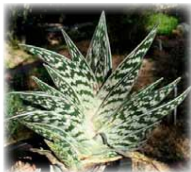
Aloe variegata is found throughout western South Africa.

Aloes are native to the Old World, in Africa, Madagascar, and Arabia. They are currently classified in the huge plant family Xanthorrhoeaceae in