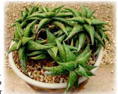
Aloe Jucunda grows at 1500 m elevation in Somalia.

Aloes are fairly pest resistant. The collector should be watchful for mealy bug infestations and aphids on their blooms. The top pest is the aloe mite. It causes the plant to change its molecular structure to grow a special habitat for the nasty little critter. Mechanical removal of the gall on the leaves or on the bloom stalk is recommended. There are some new pesticides that feature miticides in their list of ingredients that seem to work on the aloe mite, but there has been no testing and no guarantees by the manufacturers.