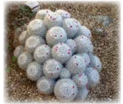
M. geminispina in the Hemenway garden.

and Nevada; down through Mexico, Central America and into South America, M. columbiana (subgenus Supertextae ) into Columbia and Venezuela. And even now new species are being discovered and described.