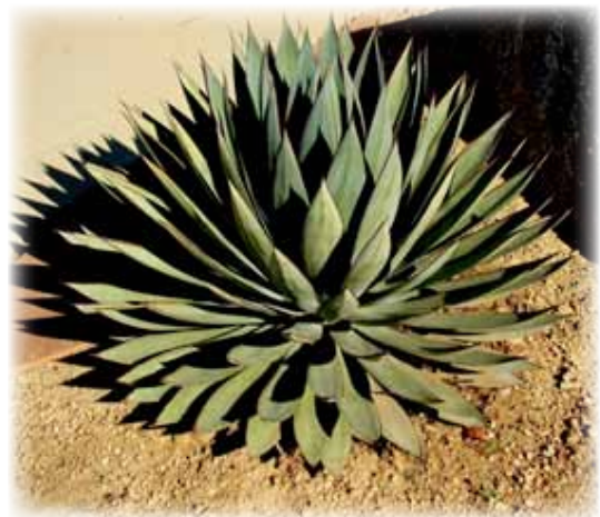
Agave cultivar "Blue Glow"