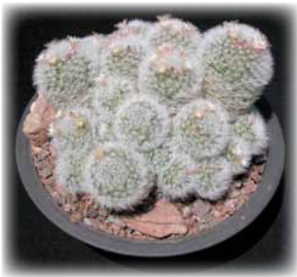
M. bocasana , typical growth habit.

First described as Cactus mammillaris , and illustrated in 1697 by Commelin and the only cactus known to Linnaeus; Mammillaria mammillaris , serves as the lectotype for the genus. The genus is further divided into, depending on author; about 12 to 21 subgenus'. These subgenus break down based on the spines, flowering, growth habit, and seed style, into more manageable units. The genus overall is characterized by raised tubercles topped