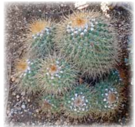
Mammillaria pringlei growing in the Hemenway garden.

Mammillarias should be potted up on a regular basis to prevent uneven growth or if preferred may be kept stunted by regularly repotting in fresh soil and being returned to the same size pot. But the clustering Mammillarias can form absolutely stunningly massive mounds that can be used to good effect in landscaping, and are beautiful in a large pot