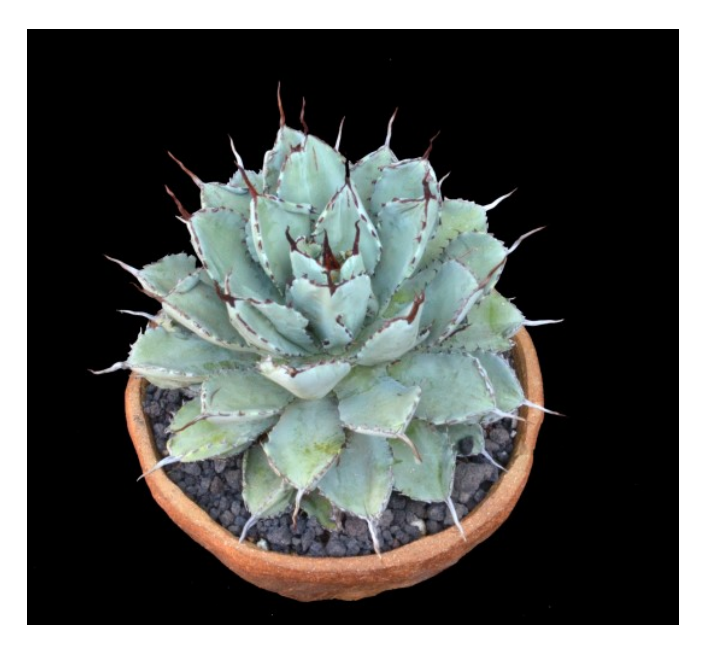
Agave potatorum cv. "cubic"

The two photos of Agaves on the right were left out of the January Communique