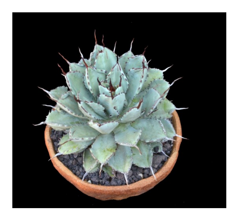
Agave utahensis var. nevadensis

The two photos of Agaves on the right were left out of the January Communique