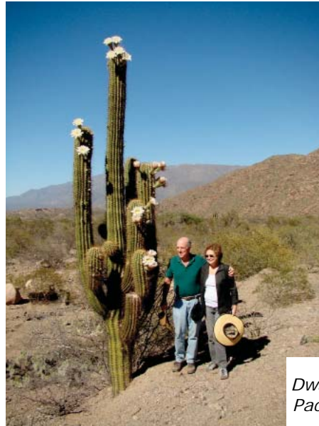
Dwarfed by a blooming Pachycereus terscheckii

Here are a couple of pictures from the Hem-enway's trip to Argentina.