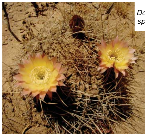
Delicate bloom on spiny Lobivia ferox