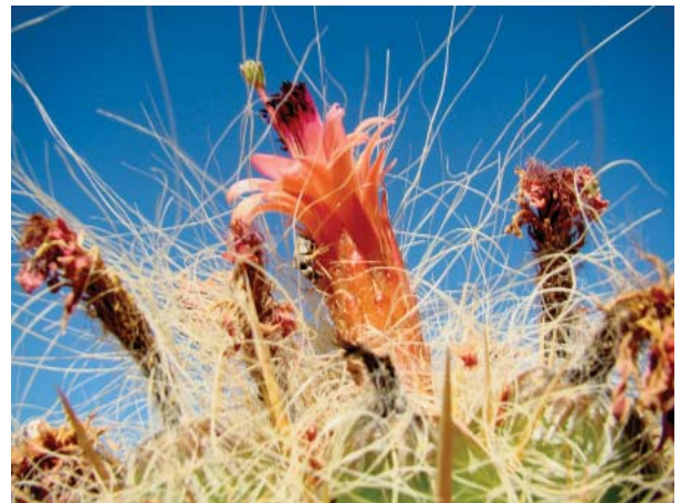
Beautiful bloom on Oreocereus celsianus (photographed at over 13,000 ft. elevation)