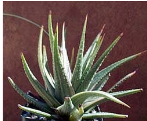
Variegated Haworthia attenuata x pumilla

Euphorbia - A number of columnar variegates are available, E. ammak , being the one most often seen. There are also some cristate and monstrose variegates as well.