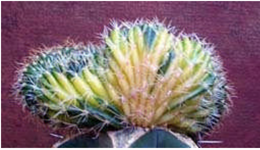
Variegated Monstrose Lobivia

These are harder to grow well than they appear.