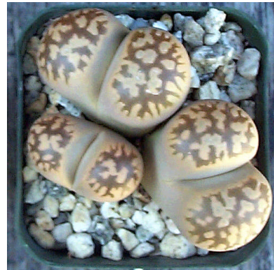
Lithops karasmontana ss.p bella C143a

They are easy to grow from seed, with seed planting best in either October or April. There are good growers who do it both ways, and some who do it both times.