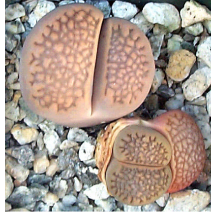
Lithops hallii C176

Lithops are small, they don't take up much room.