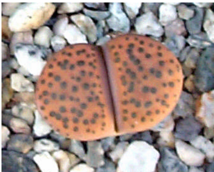
Lithops fulviceps C266

Because they are small and inexpensive, it's best to grow them in quantity. Most of the people who can't grow Lithops, have killed a few one by one. They are best grown by the dozen.