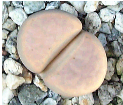
Lithops karasmontana "mickbergensis" C169

No two Lithops plants look the same, yet a knowledgeable grower can identify most species.