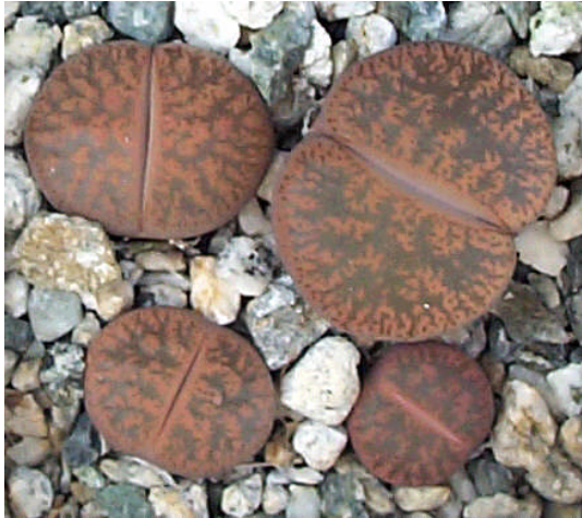
Lithops lesliei C343

Lithops are the most remarkable of all the succulent plants. At a gross level, they are very simple. All you get are two leaves, each mostly filled with water holding cells. They are dormant when the weather is too hot or too cold, and grow most in the spring.