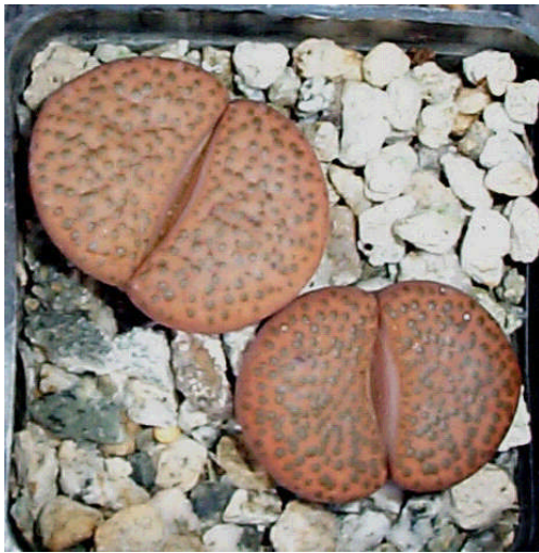
Lithops fulviceps 'Bismark'

Even the best growers have plants that mysteriously dry up, or leave during the night.