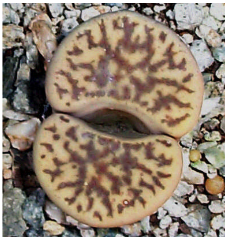
Lithops bromfieldii C348

On a fine level, no other genus has such a wealth of variation in color, shape, texture and pattern. (except maybe Conophytum).