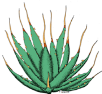
Aloe utahensis var. eborispina

29 th Inter-City Cactus and Succulent Show and Sale