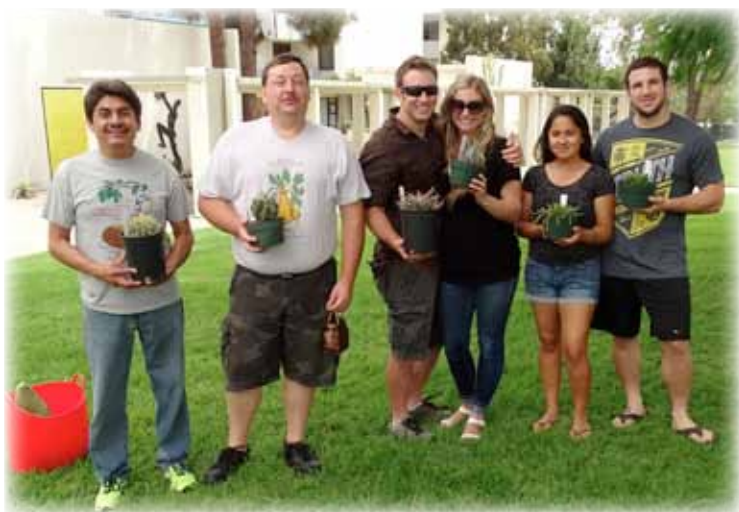
The Water Balloon Toss was a tough competition and the winning teams had to make heroic catches.