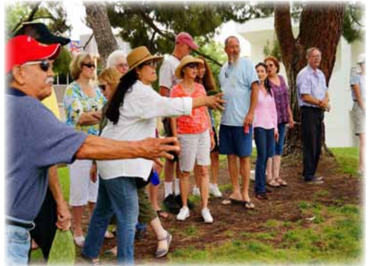
The competition was fierce in Opuntia toss competition.