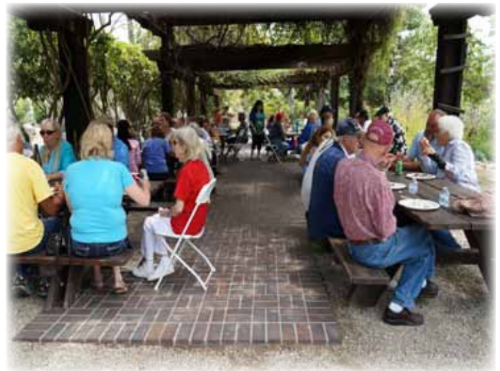
The weather was fine and everyone enjoyed a delicious picnic under the arbor.

Board of Directors Meeting – The next meeting of the Board of SGVCSS will be held on Sunday, August 18th at 2:00 pm in Ayers Hall. (Sunday of the Intercity Show and Sale)