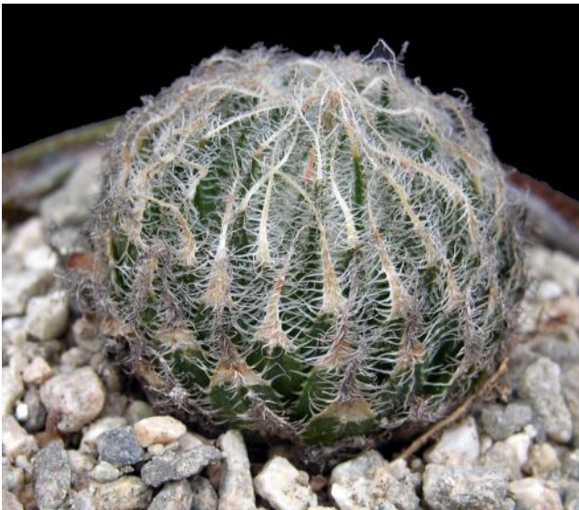
Haworthia arachnoidea v. setata

Haworthia in general are tolerant of varying potting mixes, and success has been reported with everything from straight pumice to potting soil - pumice or perlite mixes, to plain potting soil, and even garden soil. They like light fertilization when growing, any balanced fertilizer will do. Haworthia can be naturalized as a ground cover, placed under shrub cover in shadier parts of California gardens. They appreciate natural rainfall. The low pH of rainwater helps wash any residual salts from the potting mix. Control of the pH (acidity of the water) and regular fertilization during growing periods will really pay off in the quality and speed of growth.