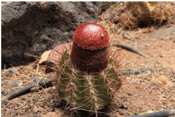
Melocactus

The plant above is NOT a cephaliated cactus. You may have seen plants like the one above in nurseries. Don't be fooled into thinking that the red part is a cephalium. The plant above is really two separate plants. The top plant is a Gymnocalycium mihanovichii grafted onto a Hylocereus .