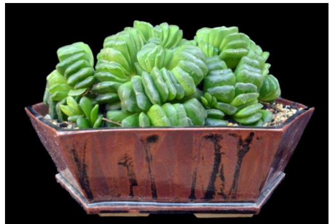
Haworthia 'lemon lime'