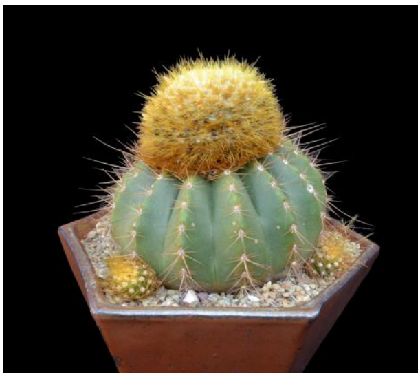
Picture is Buiningia brevicylindrica

Cephaliated plants are not difficult to grow. Most come from tropical or semi-tropical regions so they need some protection from frost. The globular cacti need a fast draining potting mix, mostly pumice works well along with steady fertilization throughout the growing season. Cephaliated structures are easily damaged, and do not recover if scarred or nicked, so some care needs to be taken with placement and potting.