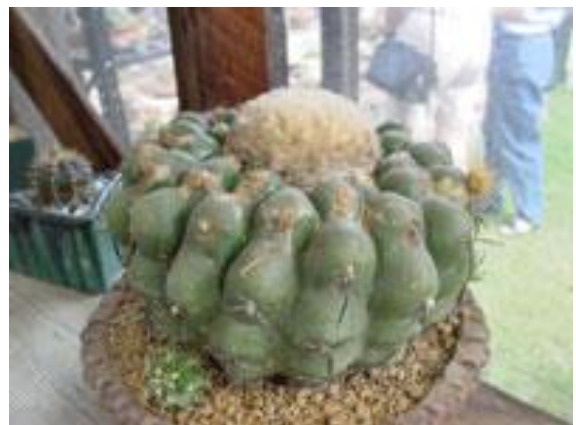
Discocactus heptacanthus photo from Larry Nichols' personal collection Photographer was Daiv Freeman