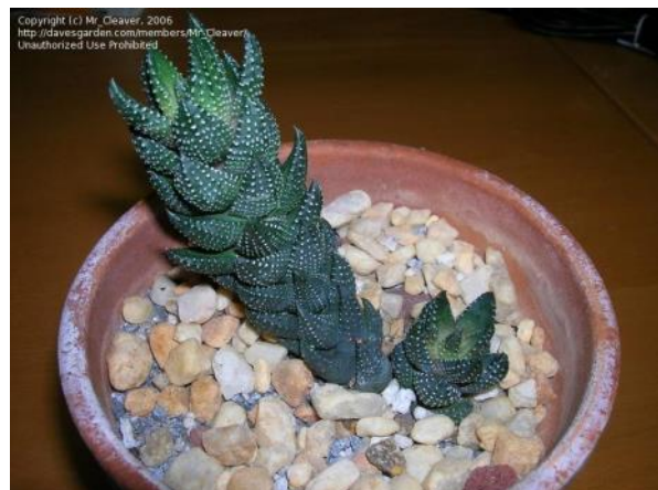
Haworthia coarctata var. tenuis