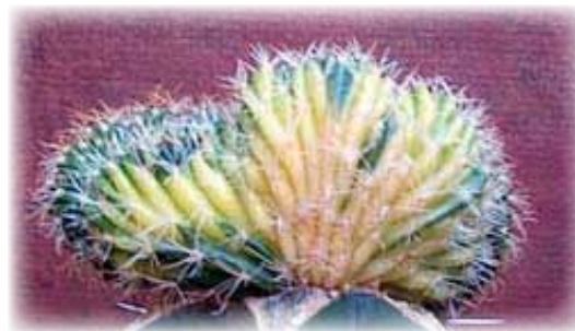
Variegated Monstrose Lobivia

Many of these are artificially propagated by grafts.