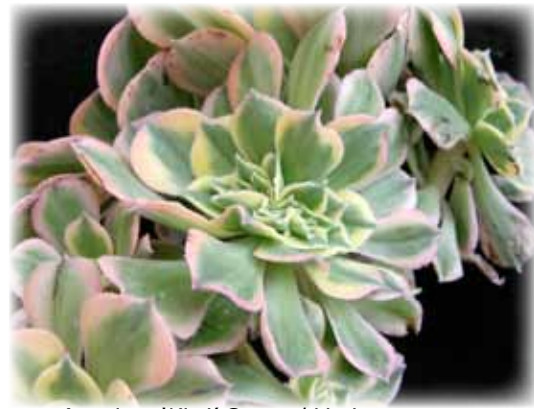
Aeonium 'Kiwi' Crested Variegate

Crassulaceae - Aeonium 'Kiwi' is only one of the many variegates found and propagated in this large family.