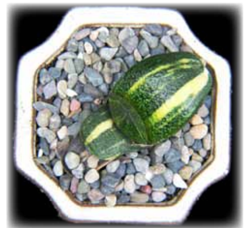
Gasteria armstrongii Variegate

The Japanese have made an art of Gasteria and Haworthia variegated cultivation. Read the 2000 CSSA Journal for just a sampling of the wonderful cultivars. Miniature white species, yellow species, even