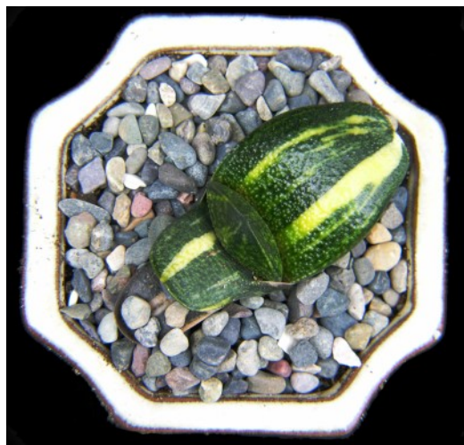
The photo above is a Gasteria armstrongii Variegata