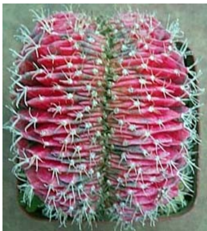
The photo above is a Variegated Gymnocalycium