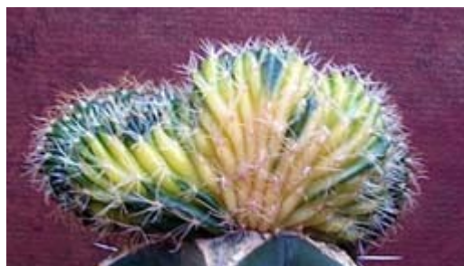
The photo above is a Variegated Monstrose lobivia